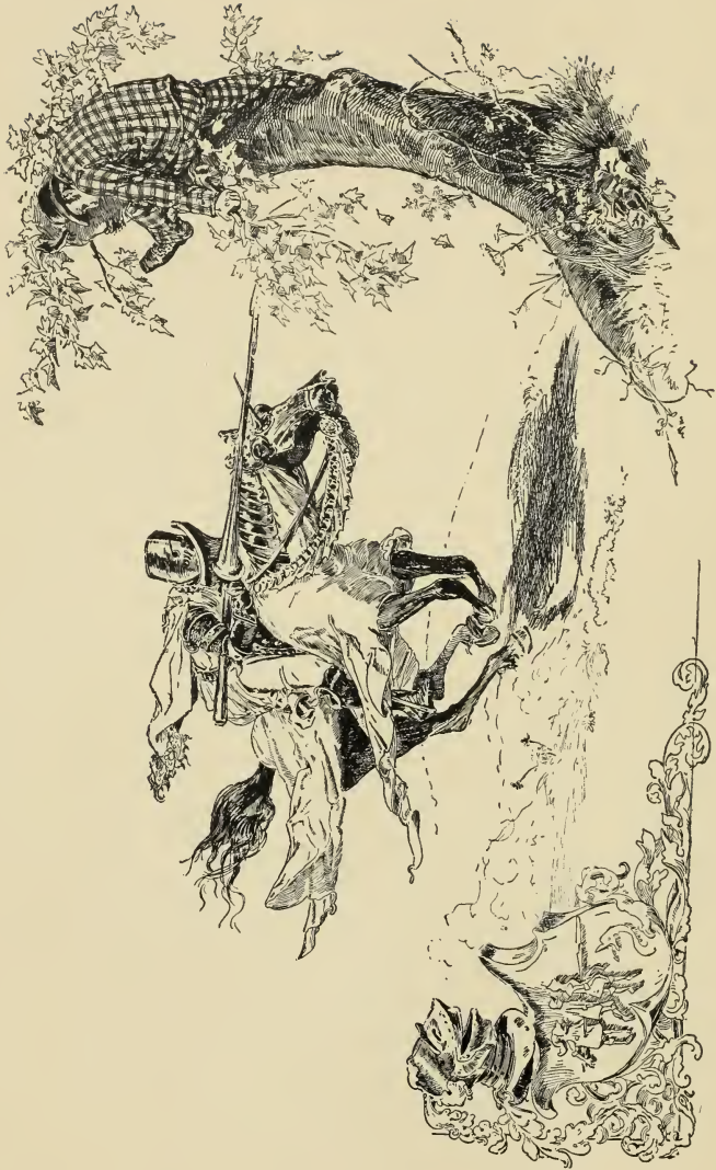
“ I SAW HE MEANT BUSINESS ”